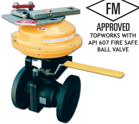
Safety link shown for illustration purposes only.