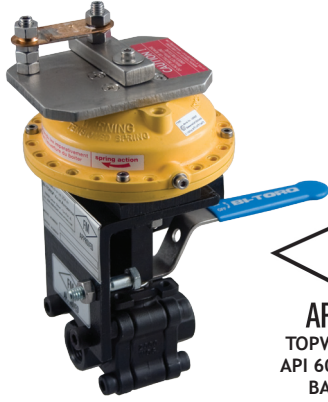
Link shown for illustration purposes only.