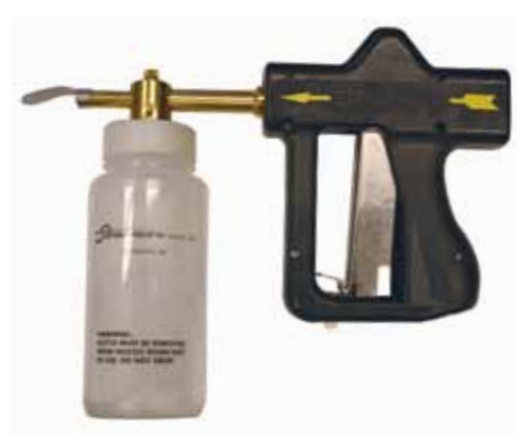
Shown: Black Hydro-Pro 150 with 16 oz. bottle