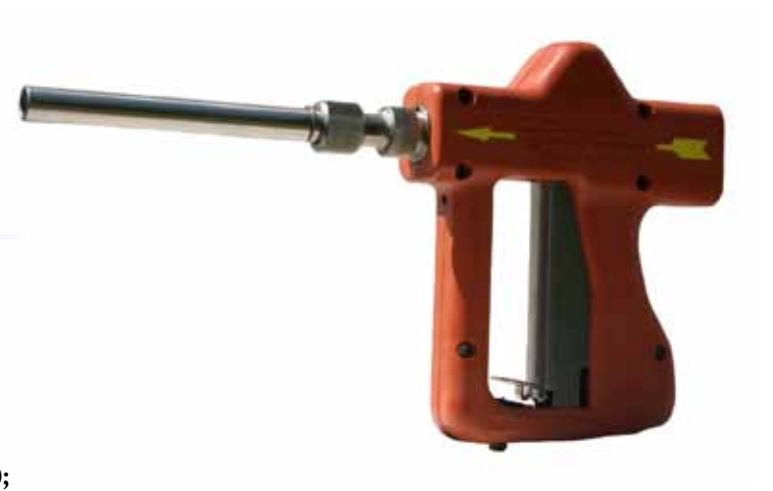
Shown: Red Hydro-Pro 150 with extension