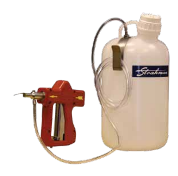
Shown: 2 gallon container attachment