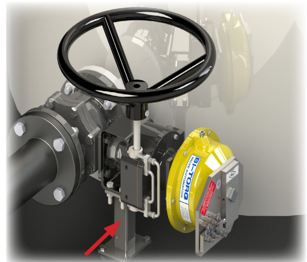
STANDARD ORIENTATION WITH HORIZONTAL AUXILIARY SUPPORTS (PROVIDED BY OTHERS)