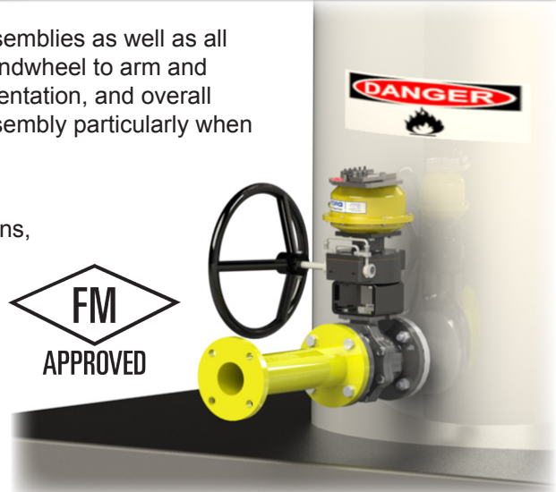
HANDWHEEL LOCATION IS MAXIMUM DISTANCE FROM TANK IN OUR STANDARD VERTICAL ORIENTATION

Check your preferred orientation and send in this form with your order.